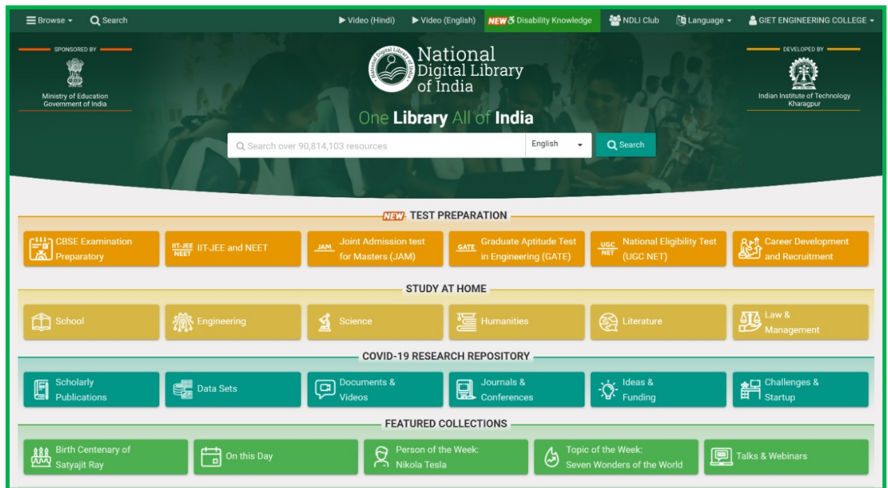
NDLI-Club interface for the year-2021-22